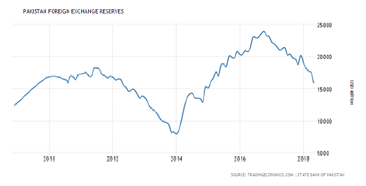
Figure 3. Pakistan Foreign Exchange Reserves from 2010 to 2018.